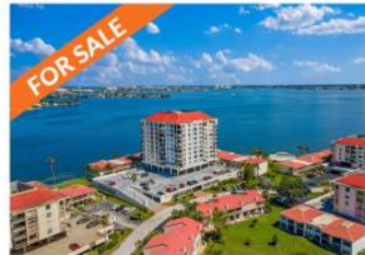
460 Sun Boulevard #3 Isla del Sol 3 Bed | 2 Bath | 1,770 SF Offered at $449,000