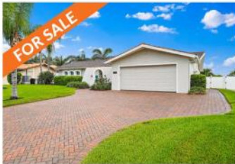
4364 44th Street S Broadwater 3 Bed | 2 Bath | 2,181 SF Offered at $1,149,000