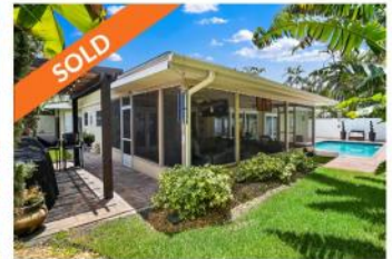
381 2nd Street W Tierra Verde 3 Bed | 2 Bath | 1,512 SF Last offered at $685,000