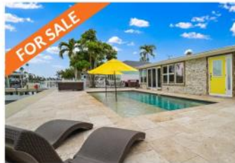
716 Pruitt Drive Madeira Beach 3 Bed | 3 Bath | 1,935 SF Offered at $1,075,000